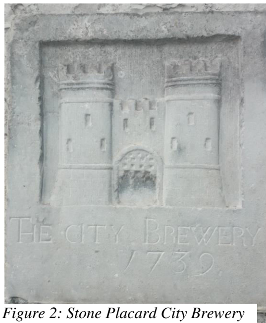
Figure 2: Stone Placard City Brewery 1739

This number however, fluctuates through different surveys and directories and the author cannot say for sure how many