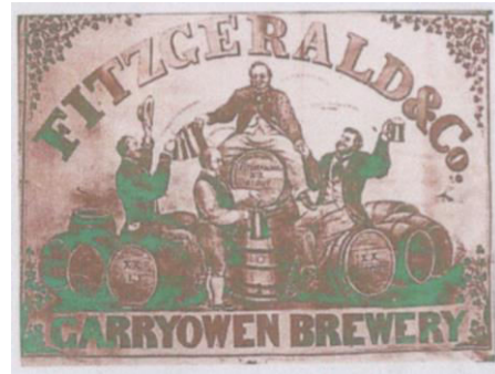
Fig. 04 Label for Garryowen Brewery

Hannon, 1991). The 1840 Limerick Ordinance Survey (LOS) map showed the brewery stretching from the Greenhill Road, Garryowen to Mulgrave Street and was on the site currently occupied by St John's Villas and Park View Terrace just to the southeastern corner of the "Markets Field" football grounds. The brewery is listed as Connell's until 1809. After which it becomes the Connell, Fitzgerald brewery until 1842. Passing to the Fitzgeralds through the marriage of Connell to Margaret Fitzgerald on nineteenth of October 1836 (McNamara, 2016). The brewery was popular locally and provided employment for up to 40 men. After 1840, it appears as Fitzgerald & Co until it ceased trading. It ceased trading in 1881 (Keyes 1945). The last brewer was John and Margaret's son Arthur (McNamara, 2016). It was the last brewery in Limerick until recent times. (For exact location see LOS map & p 37 & 38)